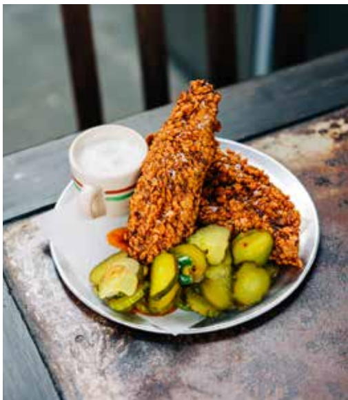
This page, clockwise from top: Emma K Photo/Courtesy Quail & Condor, Courtesy Sonoma County Tourism, Anna Wick/Courtesy Lo & Behold, Courtesy Sonoma County Tourism, Aesthete Farm & Winery, Courtesy Sonoma County Tourism, Opposite: Mariah Hurley/Courtesy Sonoma County Tourism, Rabbil Pengelly, KRM Carroll.