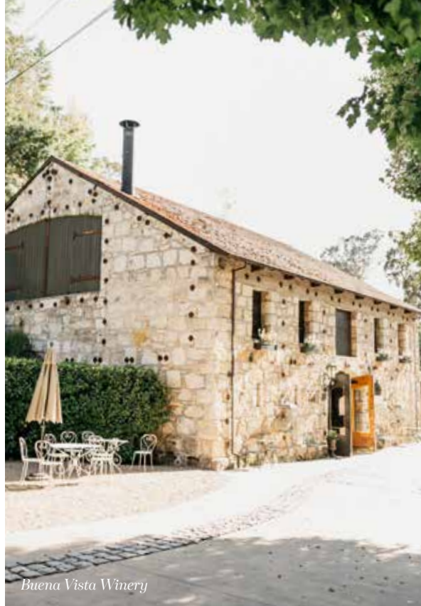
Buena Vista Winery

Above: Looking north along the coast to Goat Rock Beach, where seals and seagulls play.