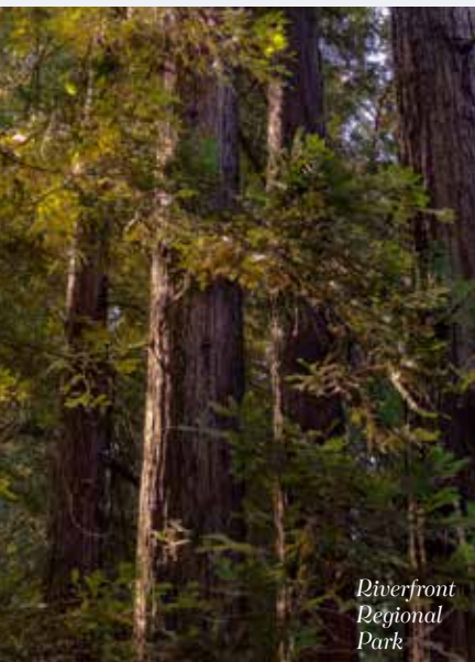
Riverfront Regional Park

Near Jenner RED HILL In Sonoma Coast State Park, the Red Hill and Pomo Canyon trails loop through coastal grasslands and very pretty stands of coast redwoods fed by nearby springs. parks.ca.gov