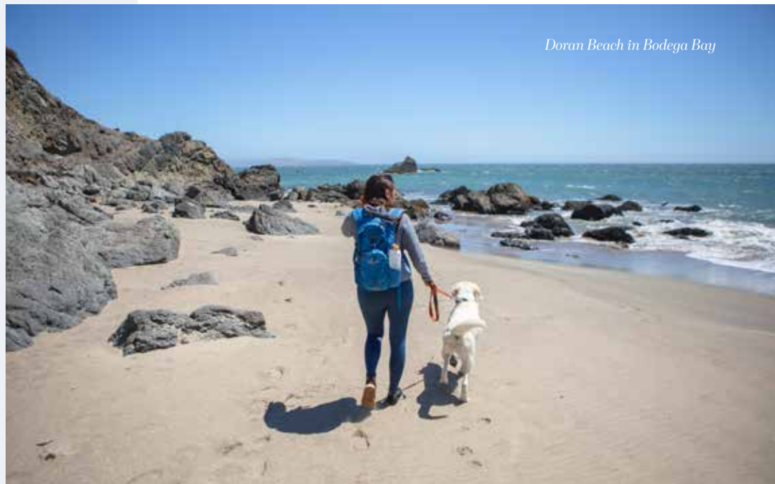
Doran Beach in Bodega Bay

The drive from Bodega out to Bodega Head adds to the magic of the day's journey. Take the time to notice the windswept hues and fluttering kites of the shops along the coastal highway, and stop in at Patrick's of Bodega Bay , a sweets shop with a sweet, pink-and-white striped paint job. Later in the week, when you're wishing you were at the coast, a stash of saltwater taffy can ease the sting ( patricksofbodegabay.com ).