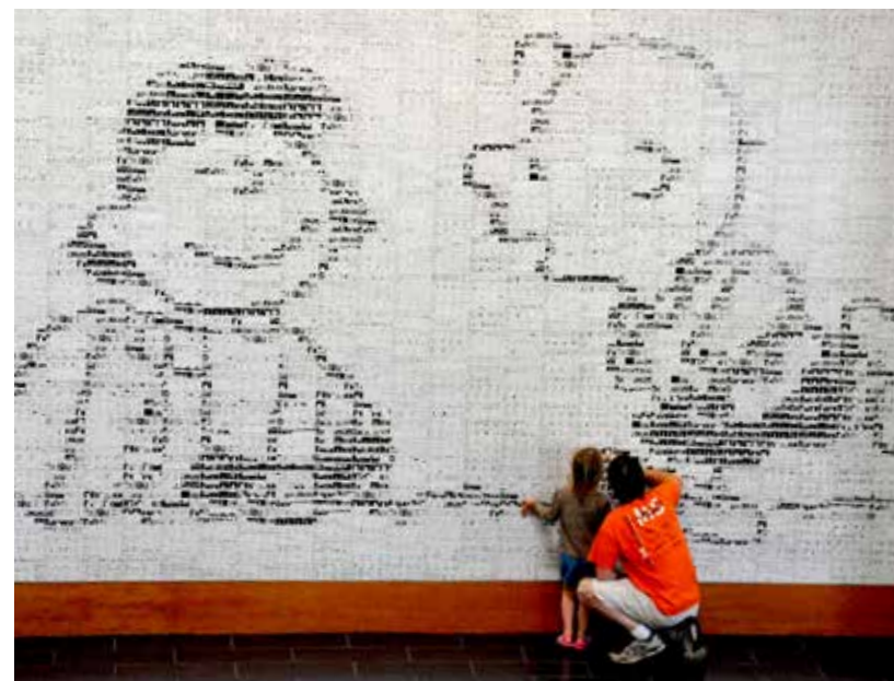
Clockwise from top: Peanut butter pie at Hazel in Occidental. Neighbors meet at Ernie's Tin Bar along Lakeville Highway. Santa Rosa's Charles M. Schulz Museum.