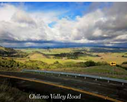
Chileno Valley Road

Ramble westward through the agricultural valleys outside Petaluma, starting on Western Avenue to Chileno Valley Road for the seasonal spectacle at Helen Putnam Regional Park. From there, take Chileno Valley Road west and then north, before looping back to town via Tomales Road and Bodega Avenue. Especially stunning when the skies clear just after a storm.