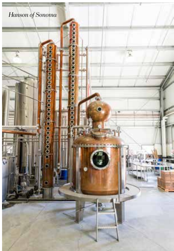
Hanson of Sonoma