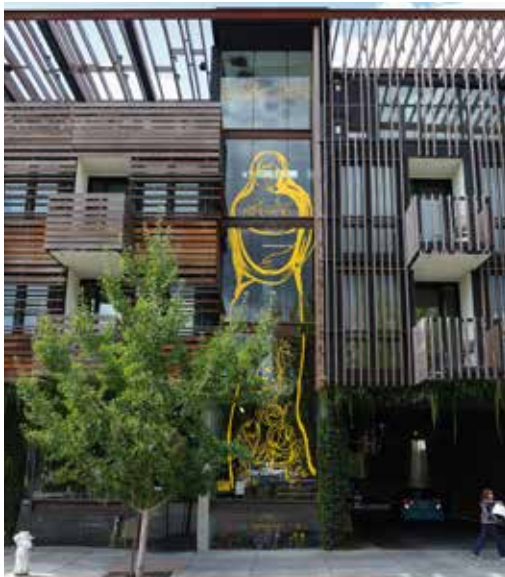
Clockwise from top left: Quail & Condor, Harmon Guest House, Lo & Behold, Aesthete Farm & Winery.

Back in town for drinks and dinner, start at Lo & Behold for a Happy Trails gin cocktail or the World's Best Vodka Soda, crafted with local Young & Yonder vodka, and maybe a pre-dinner snack of kimchi noodles, made fresh daily ( loandbeholdca.com ). Then finish at the casual Tisza Bistro ( tiszabistro.com ), a warm, neighborhood-y spot for crispy potato latkes with smoked salmon, dumplings, and schnitzel—a dinner date that's hard to break.